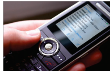
Cellular or Ethernet Receive automated emails on your smart phone, tablet, or computer on all alarms and fault conditions.