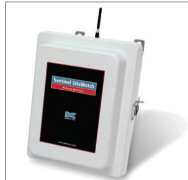
Sentinel SiteWatch Advanced networking system that allows remote access to gas detection devices in the field.