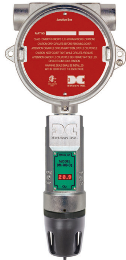
Scrolling Full Message/Text Display